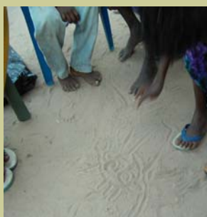
Drawing in the sand...

Nelson Mandela Said "Make every home, every shack or rickety structure a centre of learning"