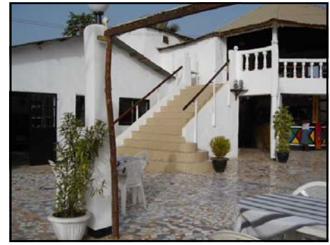
Finished & looking good! March 2006