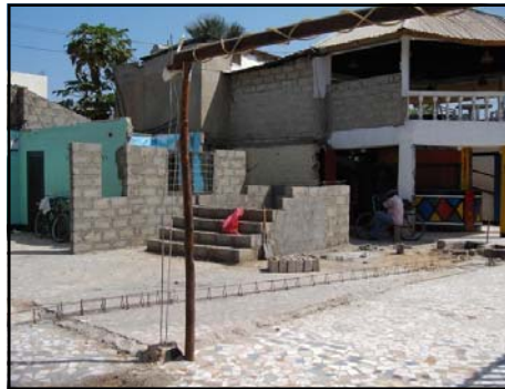
Work-in progress December 2005