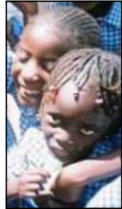
Bakoteh Nursery school