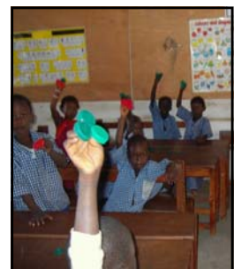
Learning to count at a GETS funded school